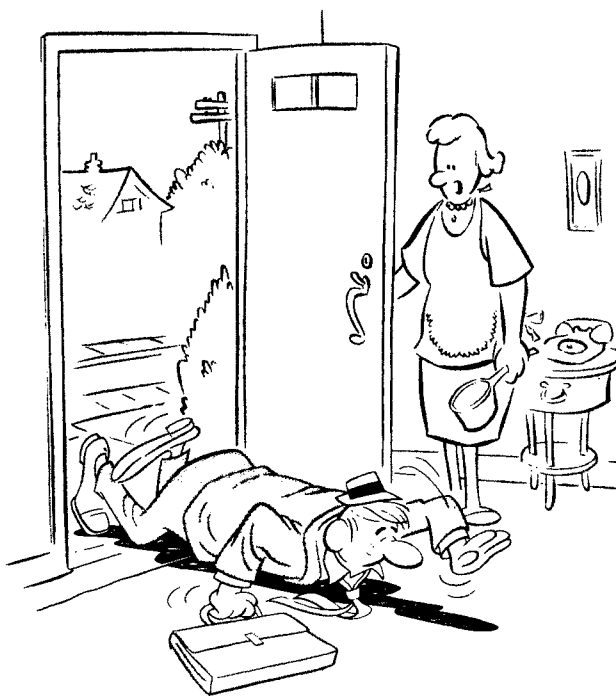
"ROUGH DAY AT THE OFFICE, DEAR?"

A recent development in interviewing promises to