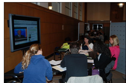
Bissett Collaborative Area , Mann Library, Cornell

The Learning Commons seeks to put technology directly into the hands of users in order to support their collaborative efforts. Technology enhanced learning is key to learning both within the classroom as well as outside of it. A Learning Commons can provide an array of technology to enhance collaborative learning such as mobile computing carts, laptops/tablet devices, digital voice recorders, digital cameras, camcorders, and "smart" style interactive technologies. By putting the technology directly into the hands of faculty and students it facilitates external classroom learning through more productive group work. Students also gain hands on experience in the use of these technologies which is often expected of them in the working world.