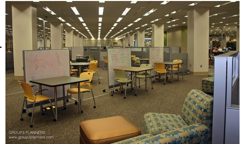
Draughton Learning Commons , Auburn University

The creative use of space is essential in a Learning Commons. Rather than looking for designated “one use” spaces, the Commons seeks to create many uses from the same space through the use of flexible furnishings and technology. This flexibility allows users to create their own work areas based upon the type of work they are doing and the number of people participating. Rather than having defined table and chairs arrangements, users can often move arrangements to suit their needs. To amplify this flexibility, support items are readily made available. These may include various sized mobile whiteboards, privacy panels, and computing carts. Spaces can also be quickly reconfigured to host small special events or lectures. Another advantage of this flexibility is it can potentially support making your Commons “larger” when needed (during high use periods) by increasing the number of furnishings, and “smaller” (low use times) by removing furnishings and thereby increasing a user’s available space.