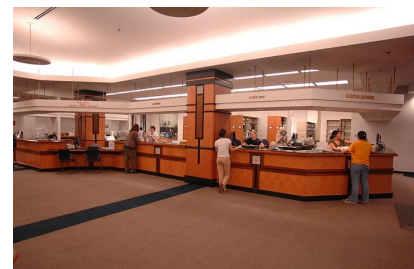
Loyola New Orleans Learning Commons

Student and faculty support services also play a central role in a Learning Commons. In the past, support services were often viewed as disparate operations. Libraries offered library support, technical services offered technology support, tutoring offered tutorial help and so on. In a 21 st century university, the lines between these supporting roles are blurred and are now often viewed as complementary to one another. A librarian helping a student with their research often finds that student needing writing support. A Writing Center tutor often encounters a student needing technical assistance. A technologist helping a user with their laptop may find them needing research help. The frequency of these crossovers is addressed in a Learning Commons by situating support services in close proximity to one another in a services zone so as to provide more seamless help for users. Services often found within a Learning Commons are library help, technology support, Writing Centers, Tutorial Services, faculty support services, and sometimes an “open” support area for services that may only be needed at certain times during the semester (i.e. Registrar or Student Activities.) By bringing these support services in closer proximity, students find much more in the way of a “one stop shop” for their academic support needs.