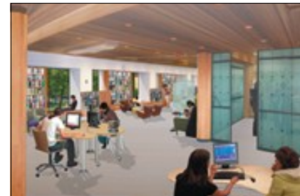
Image from conceptual design plan