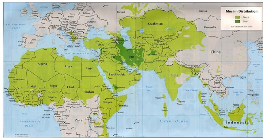
Figure 2: Worldwide Muslim Distributions

As Table 1 clearly demonstrates, the degree of Islamic practice within predominantly Islamic states varies widely, not to mention the type of Islam practiced. Nor is coverage of OIC membership completely correlative with predominantly Muslim states: Algeria, which is not an OIC member, has a Muslim population of 99%. 12 While geographic dispersal loosely tracks OIC membership combined with practicing population statistics per state (see map below), diversity among Islamic states is widespread, creating a heterogeneous mosaic of states as opposed to a monolithic “civilization” as Huntington might argue. 13