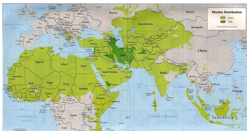
Figure 2: Worldwide Muslim Distributions

As Table 1 clearly demonstrates, the degree of Islamic practice within predominantly Islamic states varies widely, not to mention the type of Islam practiced. Nor is coverage of OIC membership completely correlative with predominantly Muslim states: Algeria, which is not an OIC member, has a Muslim population of 99%. 12 While geographic dispersal loosely tracks OIC membership combined with practicing population statistics per state (see map below), diversity among Islamic states is widespread, creating a heterogeneous mosaic of states as opposed to a monolithic “civilization” as Huntington might argue. 13