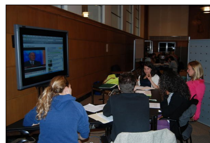
Bissett Collaborative Area , Mann Library, Cornell

The Learning Commons seeks to put technology directly into the hands of users in order to support their collaborative efforts. Technology enhanced learning is key to learning both within the classroom as well as outside of it. A Learning Commons can provide an array of technology to enhance collaborative learning such as mobile computing carts, laptops/tablet devices, digital voice recorders, digital cameras, camcorders, and "smart" style interactive technologies. By putting the technology directly into the hands of faculty and students it facilitates external classroom learning through more productive group work. Students also gain hands on experience in the use of these technologies which is often expected of them in the working world.