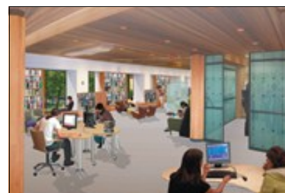
Image from conceptual design plan