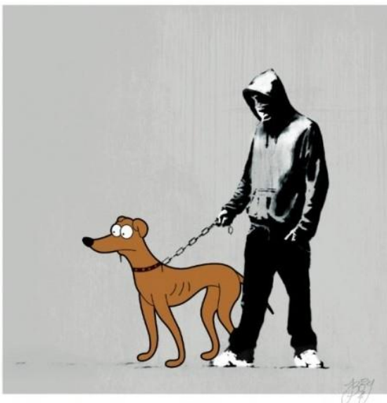
Figure 3. Very Little Helper, J-Boy 6

sons), 4 another street art collective under the moniker J-Boy created a piece of urban art entitled “Very Little Helper,” 5 a variation featuring only the Banksy hooded character walking Santa’s Little Helper, the family dog from the classic television show The Simpsons . Note that J-Boy’s creation does not use the Haring dog or any expression from the original work in the chain.