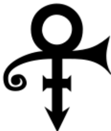
Figure 4. The Prince Symbol. 47

Ironically, in 1999, the musician Prince found himself not so much partying, 45 but instead defending himself against a copyright infringement claim in the Seventh Circuit. The case of Pickett v. Prince 46 involved an electronic guitar designer who incorporated the Prince symbol into the design of the body of a guitar.