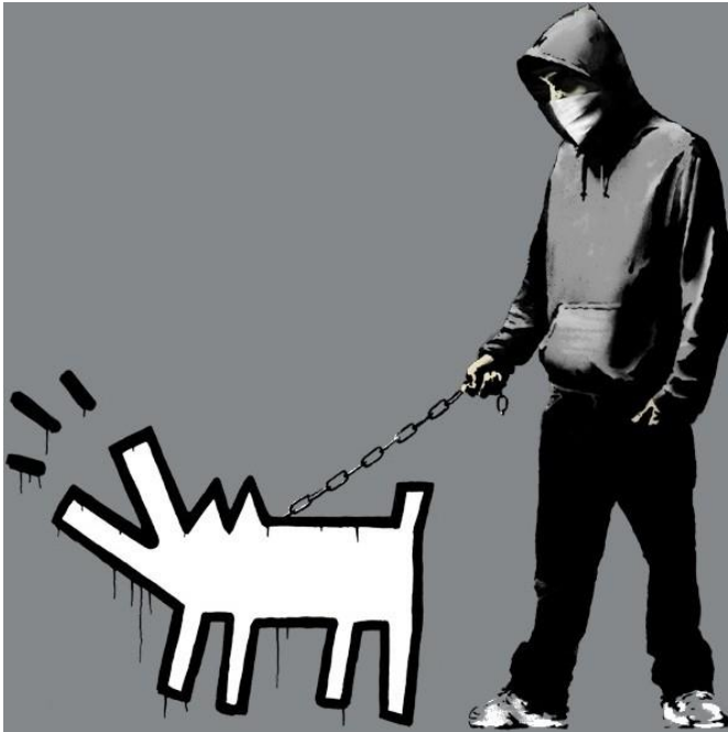
Figure 2. Choose Your Weapon, Banksy 3

Over 30 years later, the elusive street artist Banksy (most likely without authorization) created a piece of street art, entitled "Choose Your Weapon," in which a hooded character is taking the Haring dog for a walk.