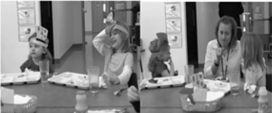
Figure 8. Side-by-side images from the Lunchtime segment. On the left, two students are looking across the table in front of lunch trays, while one signs, “You’re gullible!” to someone across the table. On the right, a teacher kneels between the same two girls signing, “Not (appropriate)” referring to a butter eating incident.