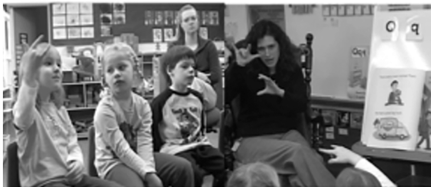
Figure 5. Side-by-side images from the Storytelling Flower Story. On the left, a student is signing, "Airplane (flies)" next to two other peers and a Teacher's Assistant sits in the background and on the right, the teacher at the front of the class is signing, "Airplane (carrying a car)."