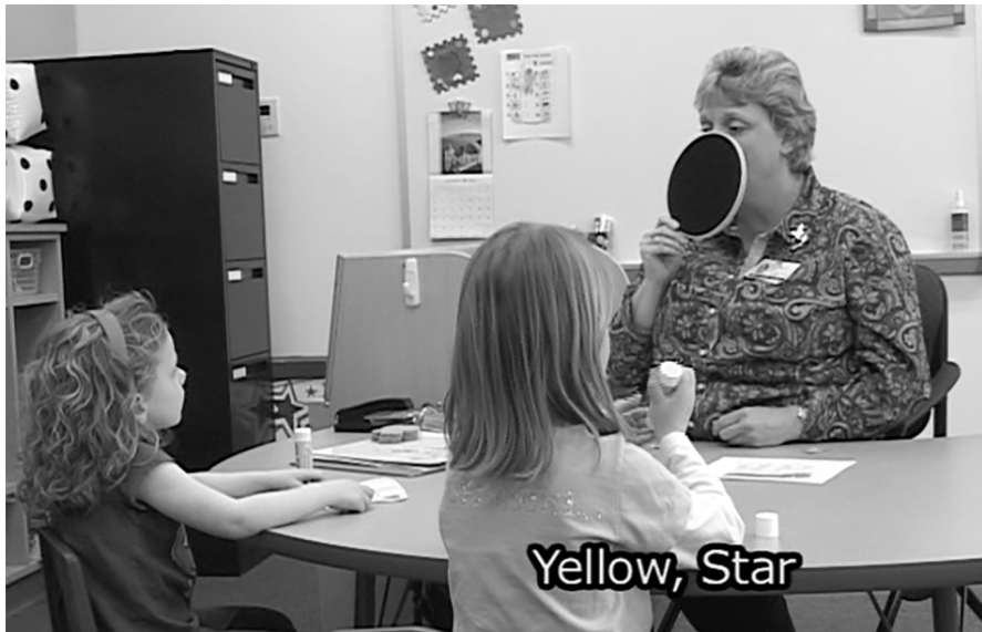
Figure 2. Therapist momentarily holds a black hoop in front of the lower half of her face, while saying, “Yellow” “Star.” Moments later, the child seated in front of her to the right mimics the same words in spoken English.