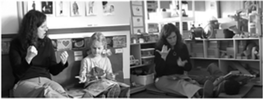
Figure 7. Side-by-side images from the Quiet-Time Reading segment. On the left, the teacher is a book with a student, taking turns; On the right, the teacher is reading a book to a student who watches while laying down.