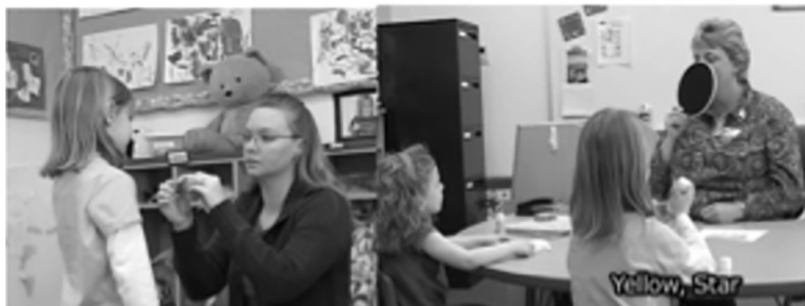
Figure 6. Side-by-side images from the Speech Therapy segment. On the left, the teacher's assistant tests a hearing aid before giving it to a student, and on the right, the speech therapist holds a black hoop over her mouth while saying, "Yellow, Star."