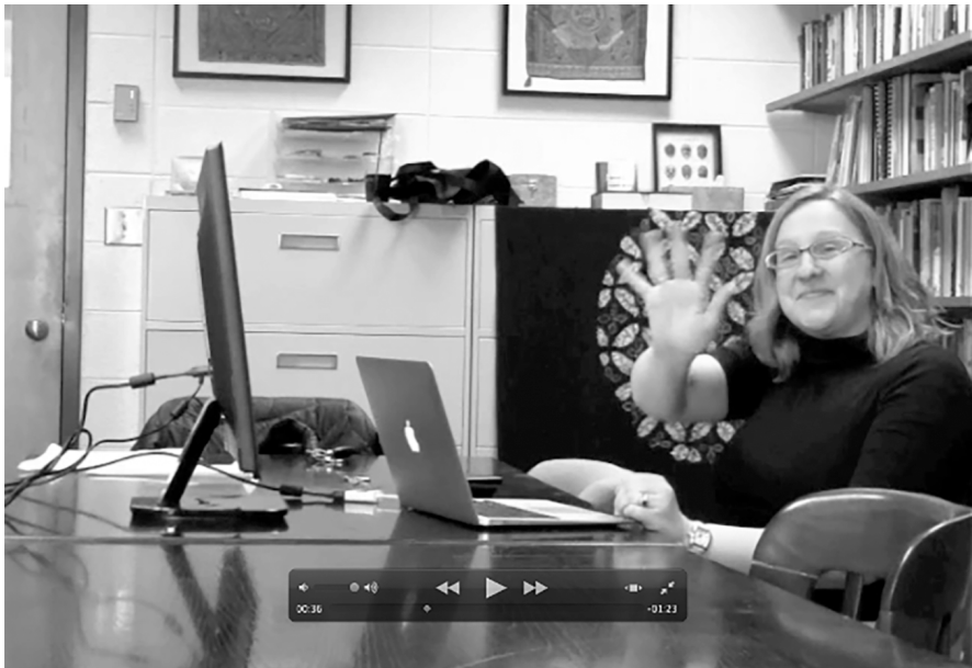
Figure 11. Researcher in an office sitting in front of a computer and monitors greets participants and welcomes them to see what she’s doing.

the visual-verbal assent video shows the researcher addressing the participants (the deaf children) directly, in an office where she does her “homework.” This concept was chosen to describe an overall purpose for being there and speaking to the participants in a familiar way—like the children in the study, she also had homework to do, and she could directly show them what she was doing and explain how they could help. From there, at each part of the short video the participants are shown and/or given more information (the video camera used in interviews) or told about their ability to “opt out” at any time, before the final agreement to participate, or not.