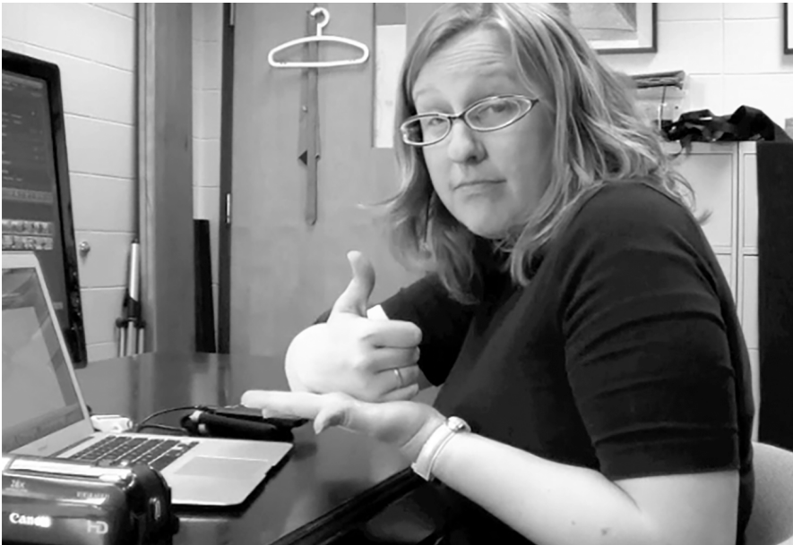
Figure 12. Researcher signing “help” at the end of the visual-verbal assent video question, “Will you help me with my homework?”