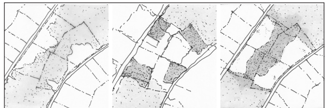
Green infrastructure planning strives to connect the natural assets of the community much in the same way that engineers design a locality's gray infrastructure. From left to right, images show existing, conventional, and preferred development and their effects on green connectivity. RPA.

When viewed from 10,000 feet, a community's gray infrastructure is clearly visible. For vehicular circulation to properly function, streets, roads, and highways have to connect, and provide places for parking, serving the built environment efficiently. These linked areas of impervious surfaces are readily observable. An aerial view shows the connected transportation whole and it is obvious that these facilities have been carefully planned. Not so with "green infrastructure." In fact, green spaces are seriously impaired by gray infrastructure, interrupting a community's capacity to convey water, provide paths for species to move among their habitats, provide shaded streetscapes and buildings, and create natural places for people to walk and bike, rather than drive. From the air, they often appear as dysfunctional fragments. Green infrastructure planning strives to connect the natural assets of the community much in the same way that planners design a locality's gray infrastructure.