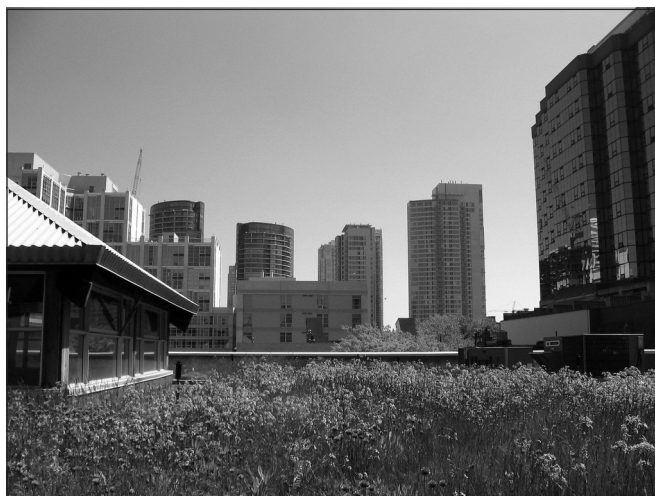
Green roofs have become more popular as their many benefits—improved air and water quality, stormwater retention, urban heat island mitigation, habitat production, improved building efficiency, longer roof life, and even beauty—have been recognized.

The green roof regulations of Portland, Oregon, for example, cover slope, waterproofing, drainage, growing medium, and vegetation types. In Los Angeles County, green roofs must be installed and maintained according to the manufacturer/vendor's instructions, vegetation must include "self-sustaining plants" that do not require pesticides or fertilizers, and 90% plant coverage must be achieved within two years. In order to be eligible for Philadelphia's green roof tax credit, an applicant has to submit documents demonstrating the adequacy of the roof's