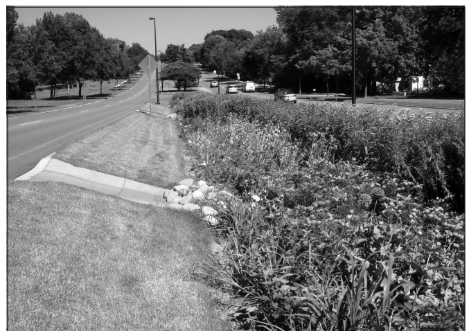
Rain gardens collect and filter stormwater.