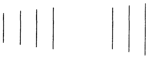
Figure 1: Tajfel and Wilkes 1963 Study 127

In a 1963 study conducted by Tajfel and Wilkes, participants were asked to estimate the lengths of lines with and without category labels. 128 Half the participants were shown two sets of lines without category labels and half were shown the same two sets of lines with category labels (four short lines labeled "A" and four longer lines labeled "B"). 129 Participants shown category labels described the lines within category A as more similar in length and reported a greater difference in line length between the category A and B lines. 130 "In other words, the labels made the examples within a category more similar and the differences across categories more distinctive." 131