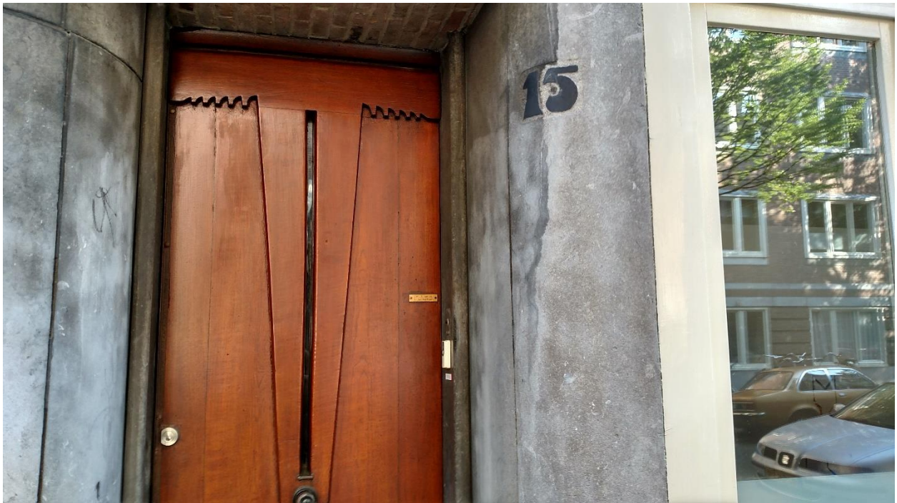
Figures 2 and 3. The Rodrigues family apartment in Amsterdam.