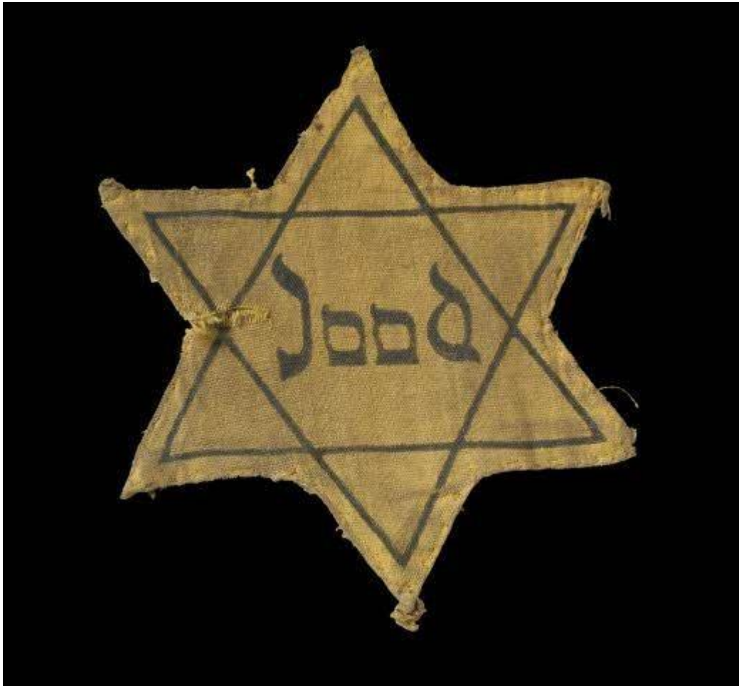
Figure 8. Photo of an actual yellow star used in Holland.

they were required to wear a yellow star so they could easily be distinguished from the rest of the population. The Dutch version of the yellow star was a slight variation on the German one: in Germany, the star had the word Jude emblazoned on it, written in a poorly executed approximation of Hebrew lettering in order to be as degrading as possible. The Dutch stars were imprinted with the Dutch translation: Jood .