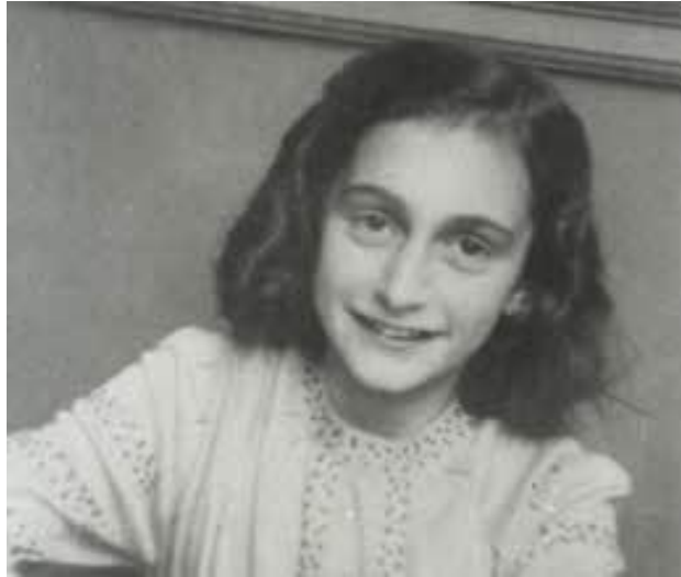
Figure 6. Anne Frank in June, 1942.