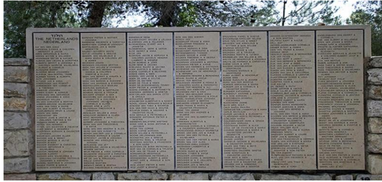
Figure 20. A portion of The Wall of Honor at Yad Vashem. ("Bogaards Family." Yad Vashem)