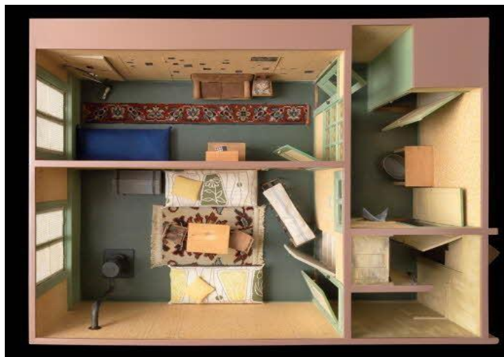
Figure 9. A model of the second of the three floors used as the Secret Annex. The room that Anne Frank shared with the dentist Fritz Pfeffer is on the upper left.