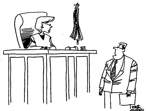
"Point taken. There's no need to get all constitutional on me."

As the French say, Toujours le change; toujours le même . Lawyers have always had a need to know how to manage the business side of the practice, and probably have always been as uncomfortable with the demands of that side of their work as they are today. Why practice management? The simple answer is because we must, in order to survive in a competitive marketplace, to thrive economically and to sustain professional standards in the practice of law. ■